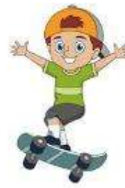
wheel and axle