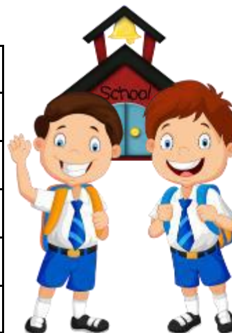
New students in Grade 2 class