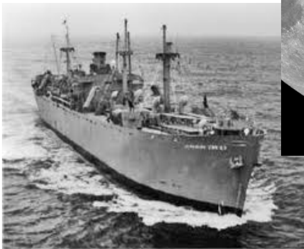
A WWII liberty ship named in Miss Mitchell's honor

Maria Mitchell is well-known for her quote , "We have a hunger of the mind. We ask for all of the knowledge around us and the more we get, the more we desire." She truly loved learning and she truly was a great astronomer.