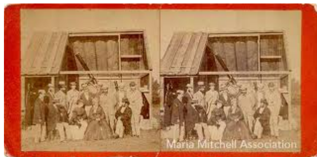
Early years of Vassar College

Maria became professor of astronomy at Vassar College in 1865 and was named Director of the observatory there. Maria soon realized that she was paid much less as a woman professor. She demande d that the college pay her just as much as the men professors. Guess what? After asking for more money, she eventually received the same pay as the men professors.