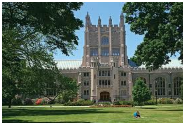
Vassar College today