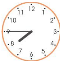
15 till 8, OR a quarter till 8